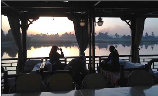
Nile sunset on the dahabaya Afandina