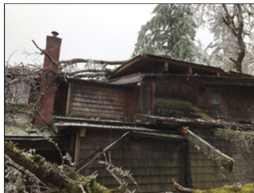
Some of the ice storm damage to our house.

Since I come from the perspective of an alchemist, I believe that all of nature and creation, both physical and in spirit, can be used as allies when appropriate, and since all forms of life (physical and spiritual) in some way have as much invested in our healing and the healing of our planet as we do, then with due respect, we can find all the support and help we need. Is there truly evil? That's a controversy I don't need to get into to make my point, yet I have had the luxury of living a relatively peaceful life as opposed to some places in the world that have known nothing but terror, loss and hatred for generations. That said, those of us who are awakening to the power of love over fear, and the potential of co-creation with spirit are having to work (dance) twice (at least) as hard to influence the collective dysfunction in which we find ourselves.