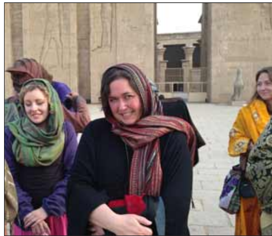
Indigo in Egypt

time in Egypt. Also, although there were other groups and boats moving about, they were able to get the temples mostly to themselves, even when they didn't go during off-hours for their special private visits.