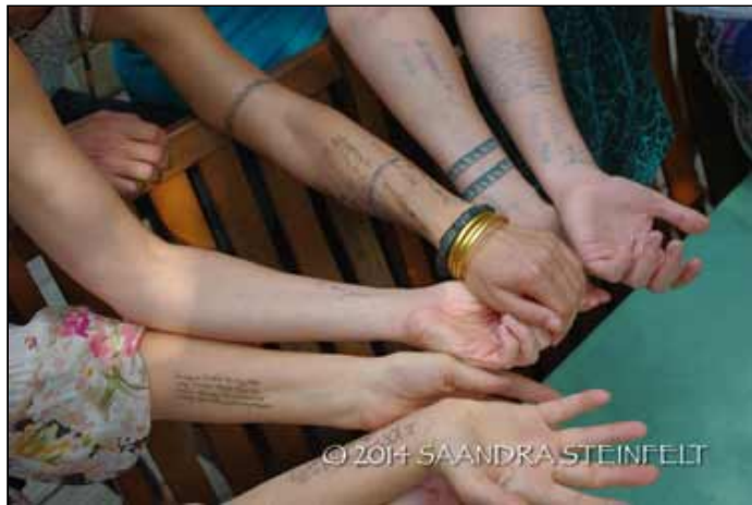
Egyptian Mysteries Retreat, 2014

Now that our book is out, we are being instructed that it is time to start the next round of Mystery School. Please join us. Save the dates and we will let you know the details soon.